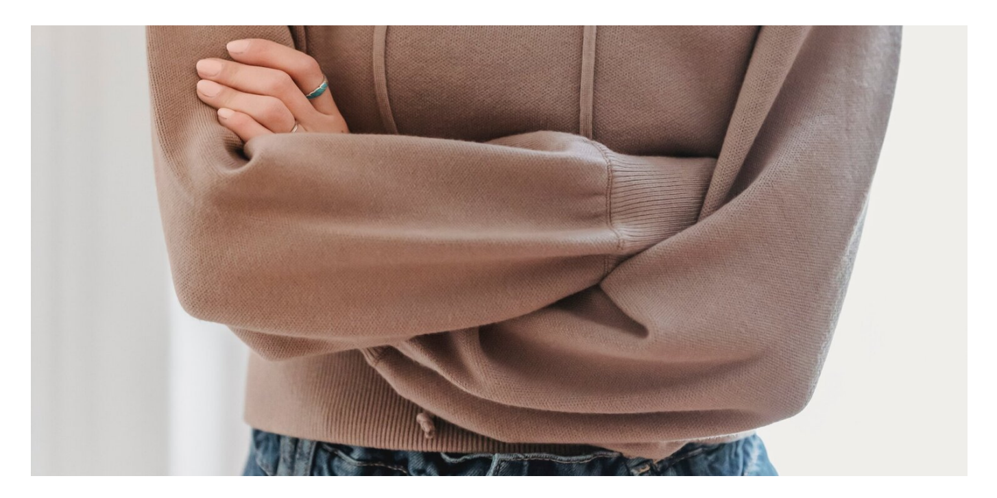
Affiliate links in this post. I may receive commission for purchases via these links at no extra cost to you. (But hey, become a student, and you can do this too!)

Wondering if the Filthy Rich Writer copywriting course is a get rich quick scheme?